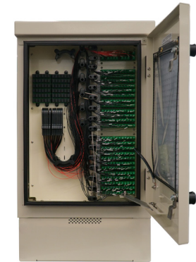
FieldSmart 288 Indoor FDH